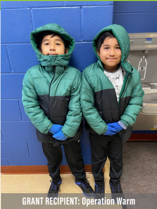
GRANT RECIPIENT: Operation Warm

Arts4Impact Bitter Jester Foundation for the Arts East on Central Association Highland Park Strings Midwest Young Artists Conservatory Music Institute of Chicago Pilgrim Chamber Players The Art Center Highland Park Uptown Music Theater of Highland Park