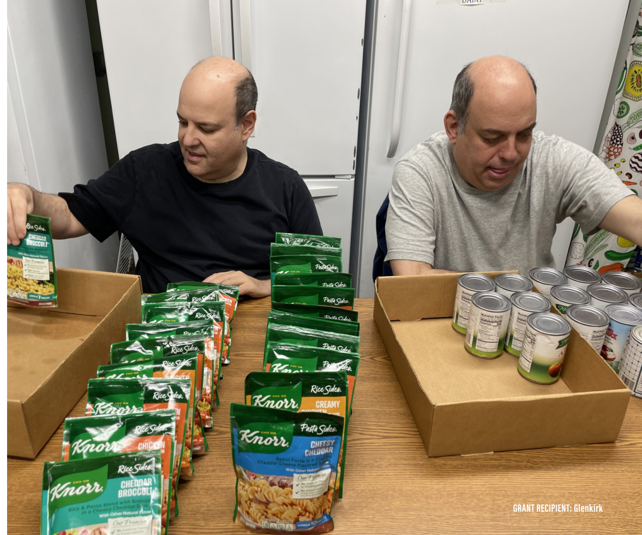
GRANT RECIPIENT: Glenkirk

Looking forward, we remain deeply committed to advancing our vision of an inclusive, vibrant community where every individual is empowered to thrive. With the ongoing support of our donors, partners, and community leaders, we will continue to strengthen the resources that help our neighbors rise above adversity and reach their full potential.