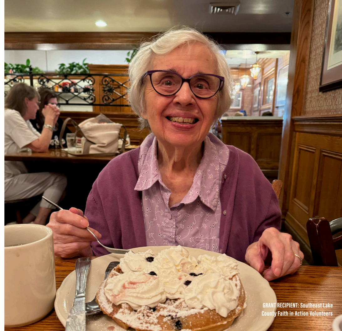
GRANT RECIPIENT: Southeast Lake County Faith in Action Volunteers

of students in District 112 and 14% of HPHS students live in households with incomes below the federal poverty threshold