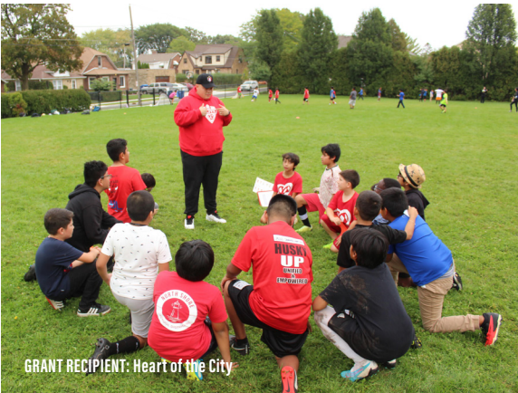
GRANT RECIPIENT: Heart of the City

Arts of Life Center for Enriched Living Collaborative Community Housing Initiative Glenkirk Keshet Northern Suburban Special Recreation Association