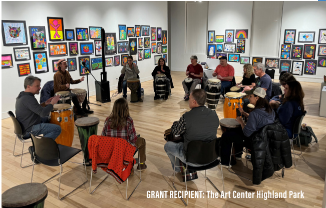
GRANT RECIPIENT: The Art Center Highland Park

Kids Rank Mothers Trust Foundation North Suburban Legal Aid Clinic Operation Warm Parks Foundation of Highland Park United Way of Lake County Youth Services Zacharias Sexual Abuse Center