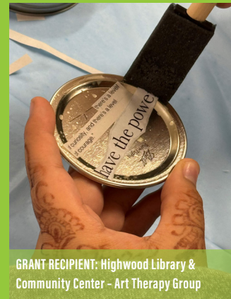
GRANT RECIPIENT: Highwood Library & Community Center - Art Therapy Group