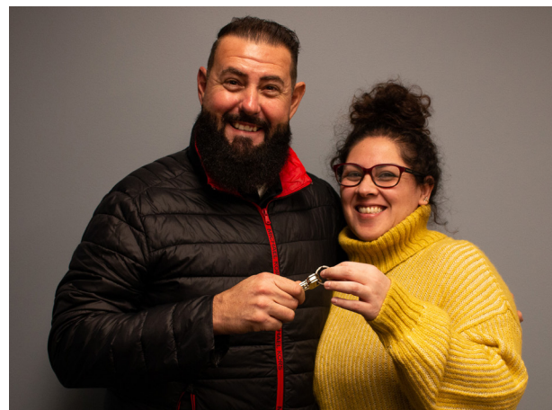
GRANT RECIPIENT: Community Partners for Affordable Housing - new HP homeowners