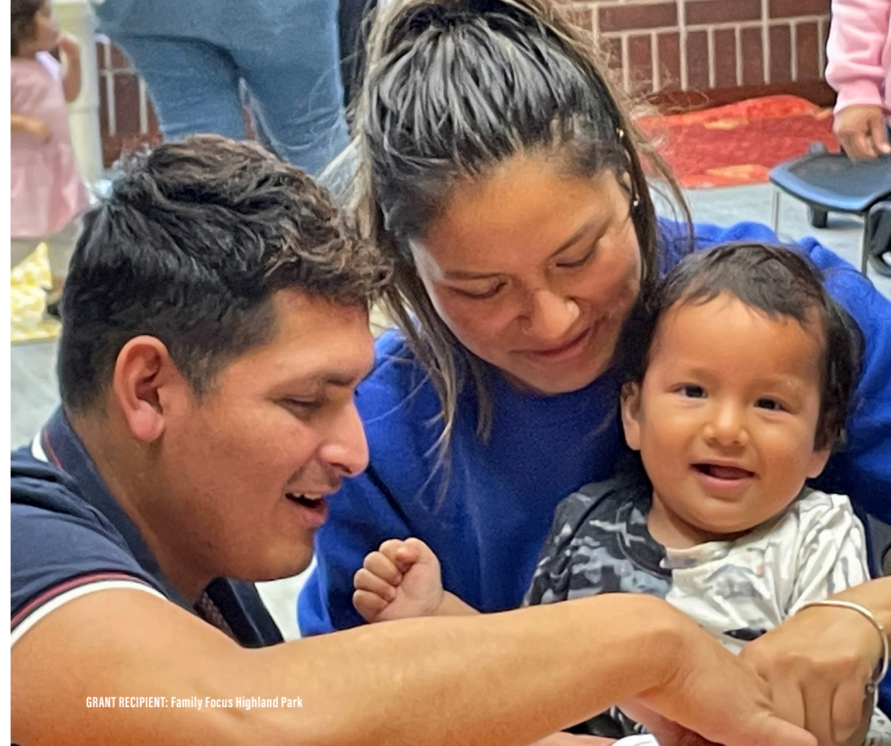
GRANT RECIPIENT: Family Focus Highland Park

In 2023, our commitment to community translated into the distribution of over $1.1 million to address residents' needs and improve the quality of life for everyone. This included nearly $785,000 in Annual Grants and an additional $367,000 strategically allocated to address the ongoing challenges faced by residents affected by the Highland Park shooting. With a 32-year legacy of unwavering support for the community , fueled by the enduring generosity of our donors, we will continue to be a safety net creating a thriving future for all.