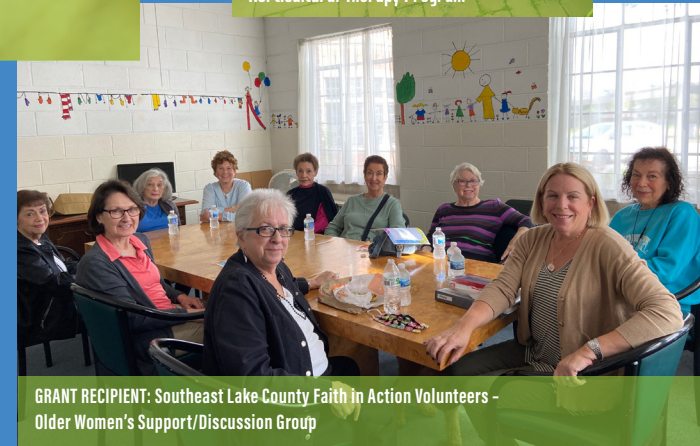
GRANT RECIPIENT: Southeast Lake County Faith in Action Volunteers - Older Women's Support/Discussion Group