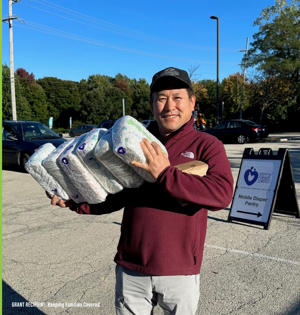
GRANT RECIPIENT: Keeping Families Covered

* Includes $1,250,000 of City of HP funds the Council has budgeted annually since 2018 for HPCF distribution to nonprofits that serve our community, a portion of which has been funded through an agreement between the City and Ravinia Festival.