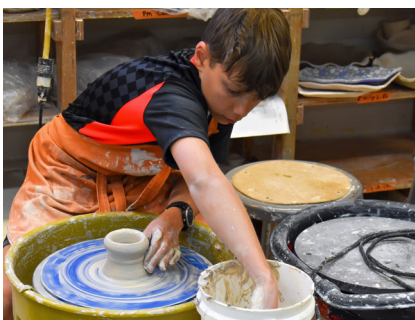
GRANT RECIPIENT: The Art Center Highland Park