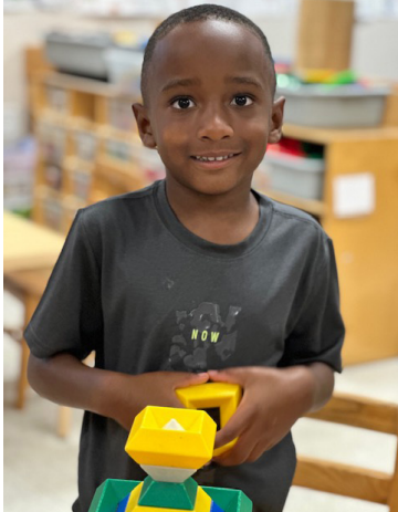
GRANT RECIPIENT: Highland Park Community Early Learning Center