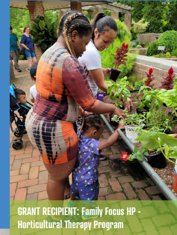
GRANT RECIPIENT: Family Focus HP - Horticultural Therapy Program