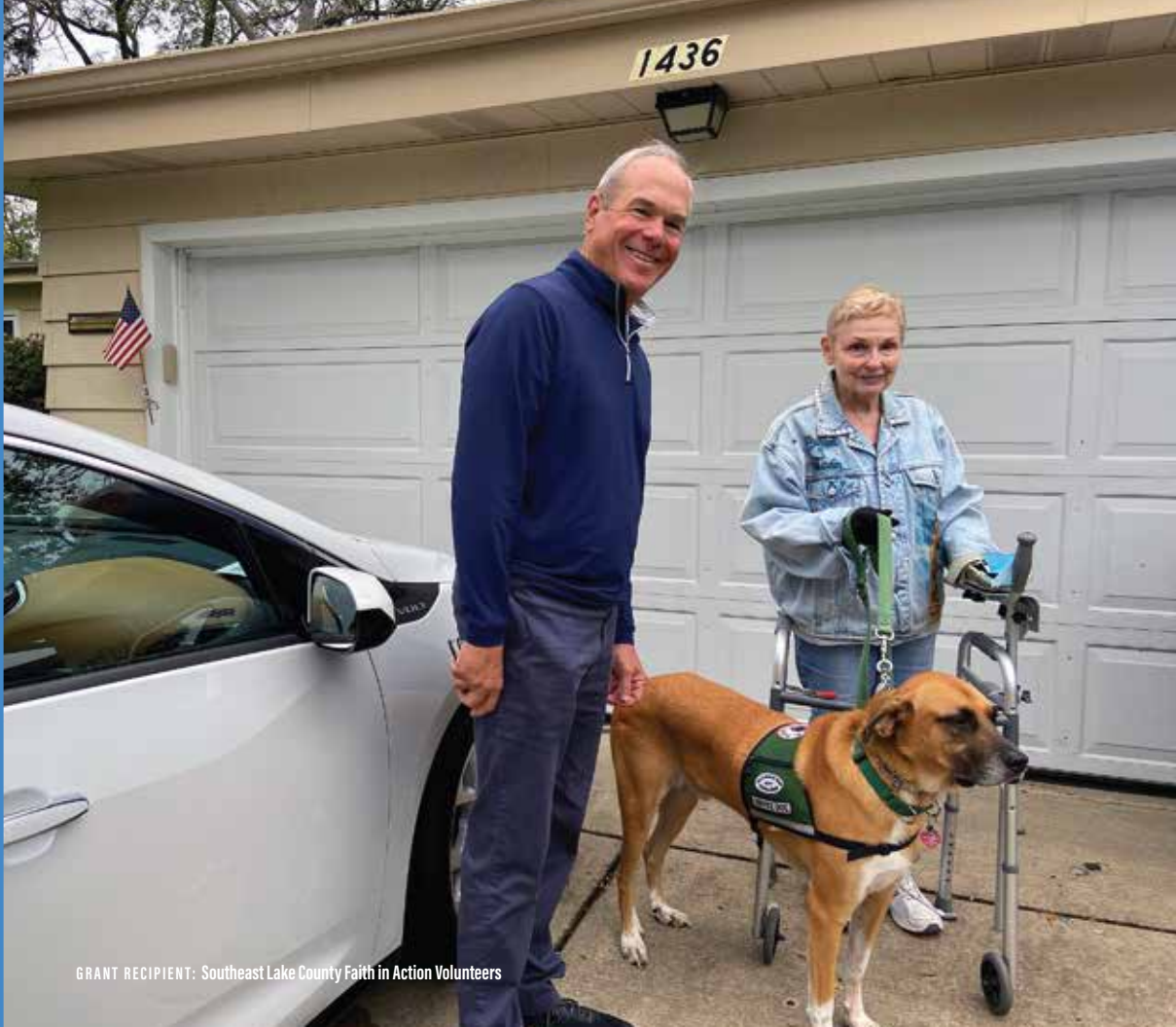
GRANT RECIPIENT: Southeast Lake County Faith in Action Volunteers