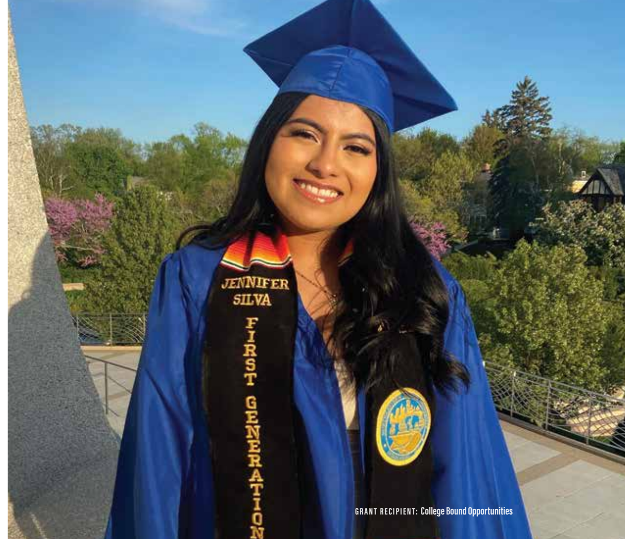
GRANT RECIPIENT: College Bound Opportunities

Community – The Anti-Drug Coalition GPF Foundation Highland Park After Prom Save a Star Drug Awareness Foundation