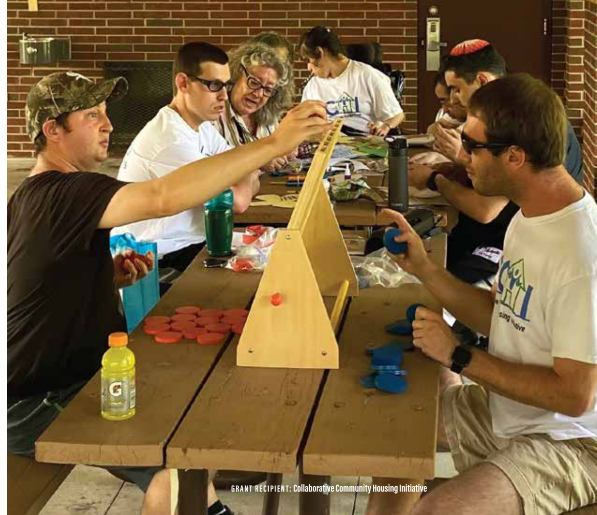
GRANT RECIPIENT: Collaborative Community Housing Initiative

In 2021, we distributed nearly $710,000 in annual and emergency grants to make possible what otherwise would have been impossible for children and adults throughout Highland Park and Highwood. In total, since our founding, we have infused over $3.8 million into our community to help neighbors and improve the quality of life for all Highland Park and Highwood residents.