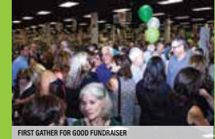
FIRST GATHER FOR GOOD FUNDRAISER

Board establishes a COVID-19 Emergency Relief Fund and between March of 2020 and December of 2021 distributes $240,000 to address urgent needs of residents stemming from the pandemic