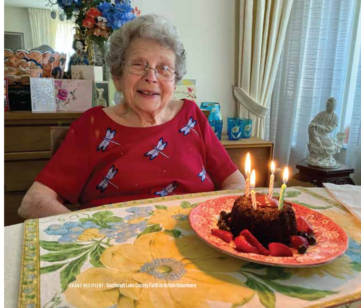
GRANT RECIPIENT: Southeast Lake County Faith in Action Volunteers

“Thank you for recognizing the value of emergency funding to small organizations like Faith in Action Volunteers. Your stewardship is an example to other leaders in the community.”