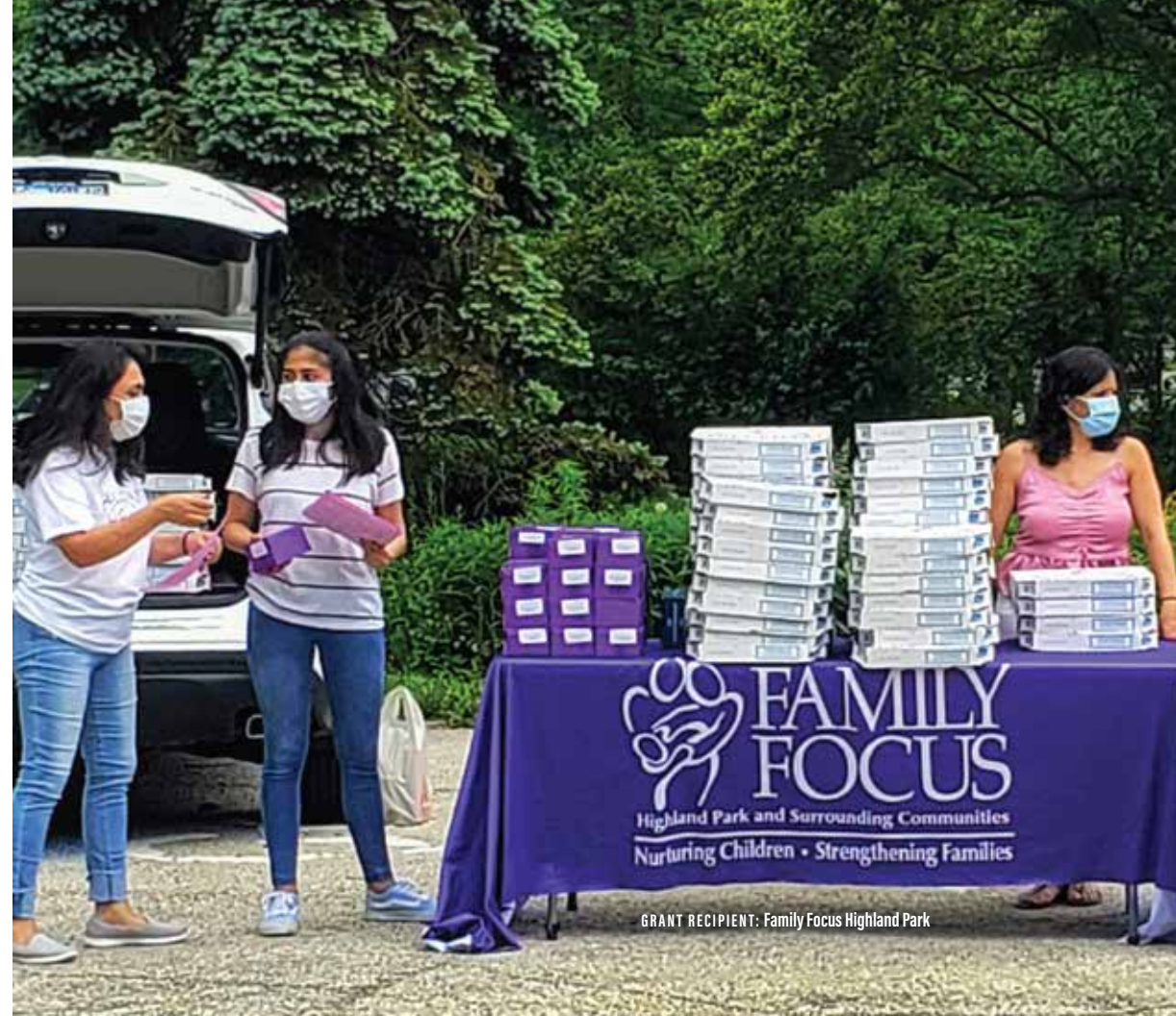
GRANT RECIPIENT: Family Focus Highland Park

Community – The Anti-Drug Coalition Save A Star Drug Awareness Foundation