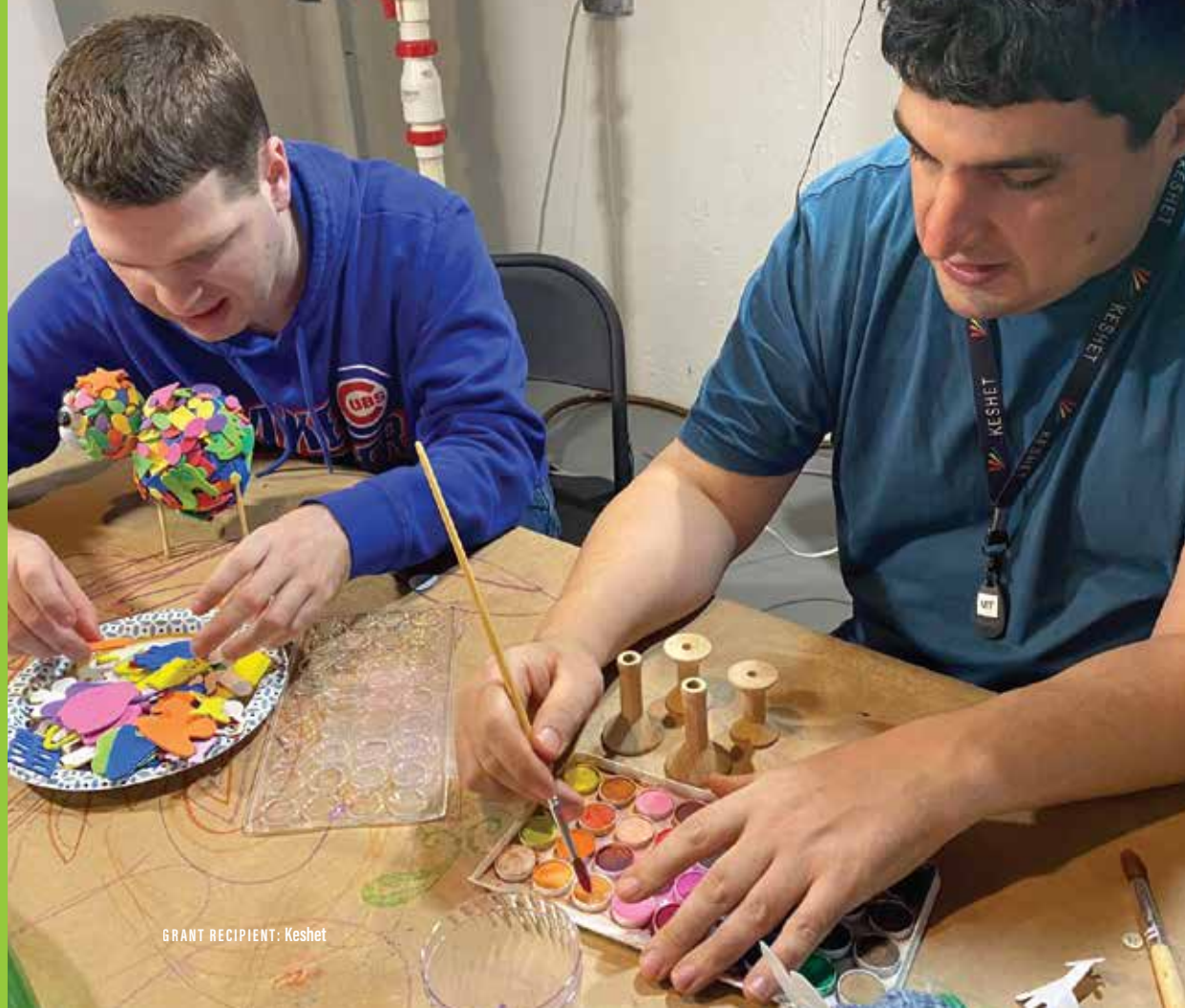
GRANT RECIPIENT: Keshet