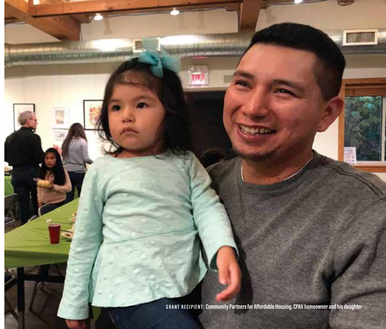
GRANT RECIPIENT: Community Partners for Affordable Housing, CPAH homeowner and his daughter

Thanks to our generous donors, in 2020 we provided nearly $660,000 in emergency and annual grants, making a powerful difference for so many neighbors.