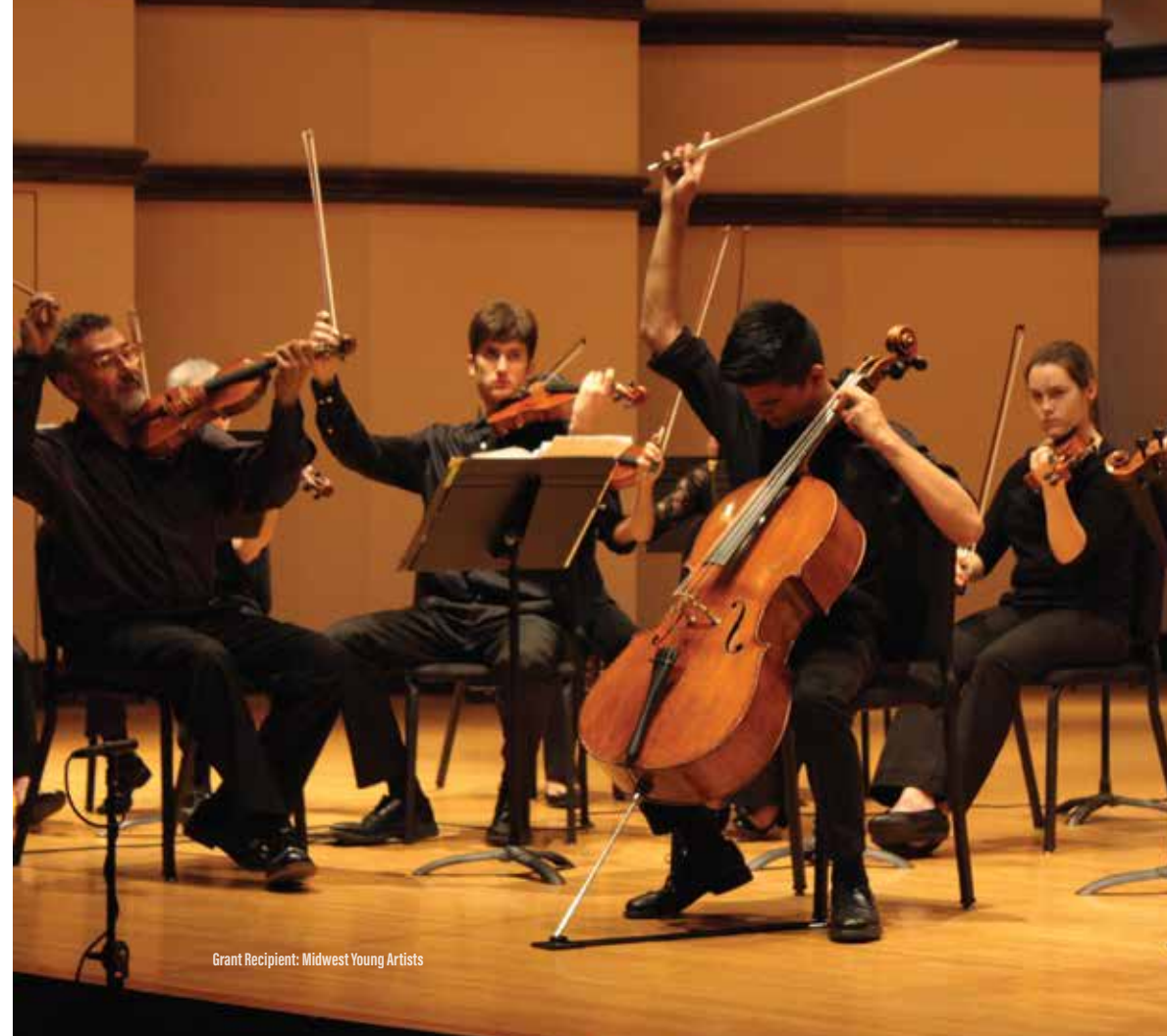
Grant Recipient: Midwest Young Artists