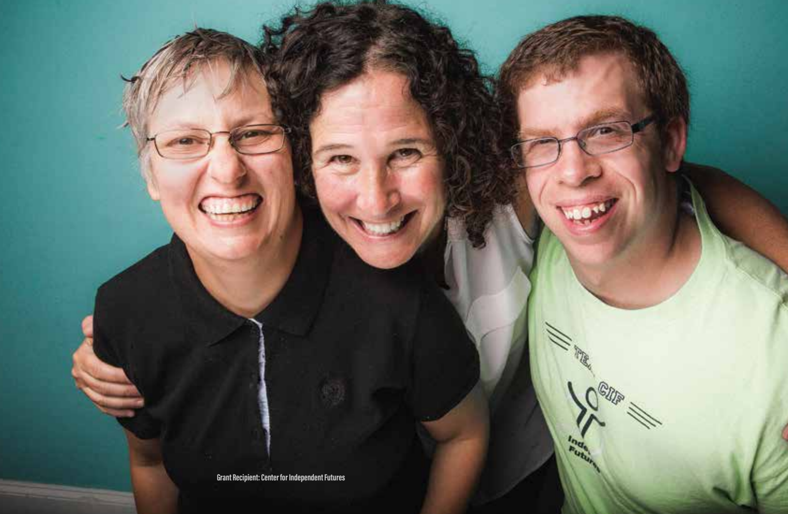
Grant Recipient: Center for Independent Futures