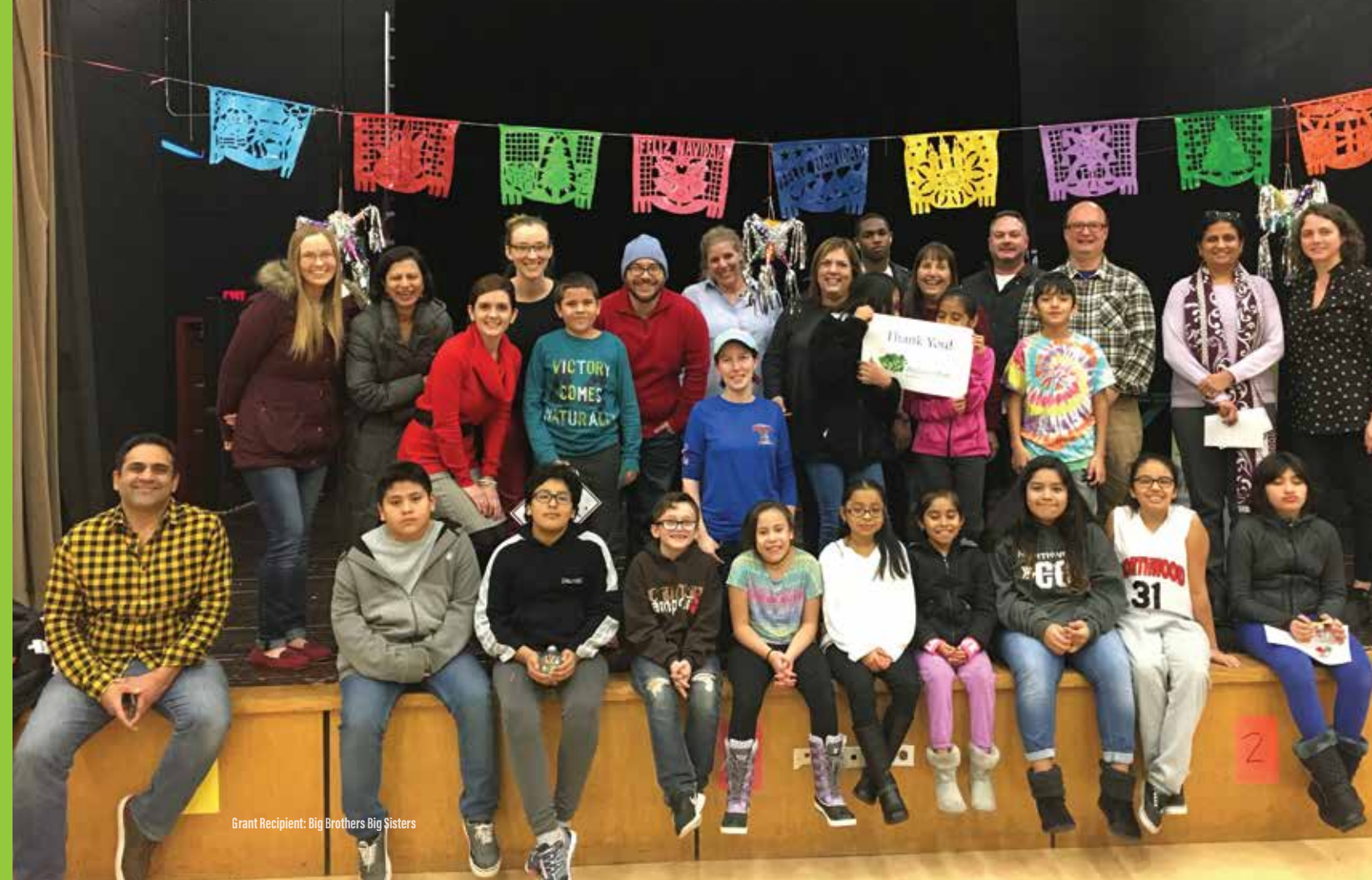
Grant Recipient: Big Brothers Big Sisters

This report illustrates many of the ways in which the Foundation addressed the needs in our community and added to its vibrancy in the past year. Thanks to our generous donors, we were able to infuse more than half a million dollars into Highland Park and Highwood in 2019, making a real impact on so many of our neighbors.